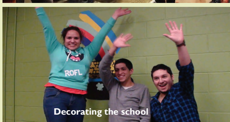
Decorating the school