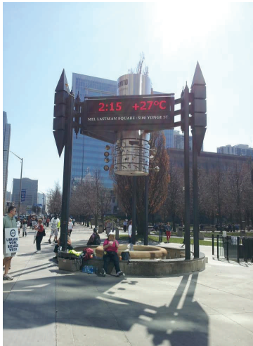
March 20. Outside Omnicom School at North York Center, Toronto.