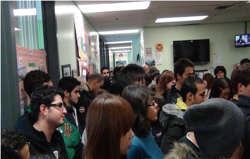
A minute of silence.

For more videos, visit http://www.youtube.com/user/OmnicomTO/featured