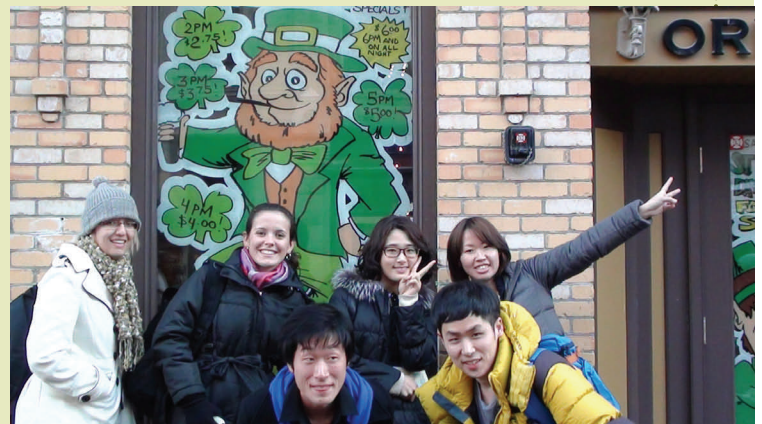
Steven Ave Walk

Students enjoyed learning about why we celebrate Saint Patrick's Day in Canada while they made decorations and sang Irish songs, then took great pleasure in decorating the school with their handwork. Friday the 16 th they had the opportunity to enjoy being Irish for the day by dressing in green for our after school party where